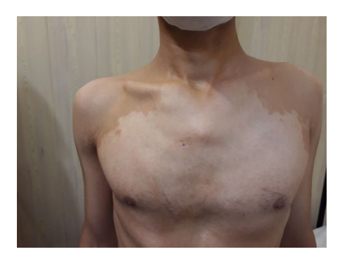
Fig. 1: Hypopigmented skin lesions in the chest

In paraclinical data, Complete blood count(CBC), Liver function tests(LFT), and kidney function were normal, viral markers were negative, alpha-fetoprotein (AFP) was 4.8 (ng/mL),and cancer antigen 19-9(CA-19-9) was 3.2 (U/mL). With an impression of CD, he underwent Magnetic resonance cholangiopancreatography (MRCP), in which multiple cystic dilatations in intrahepatic bile ducts (central dot signs) with normal extra-hepatic bile ducts were reported (Figure 2), which confirmed CD. We